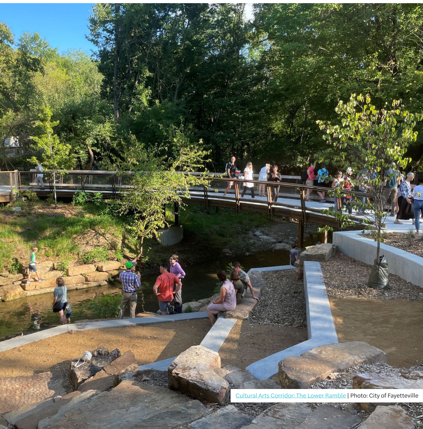
Cultural Arts Corridor: The Lower Ramble