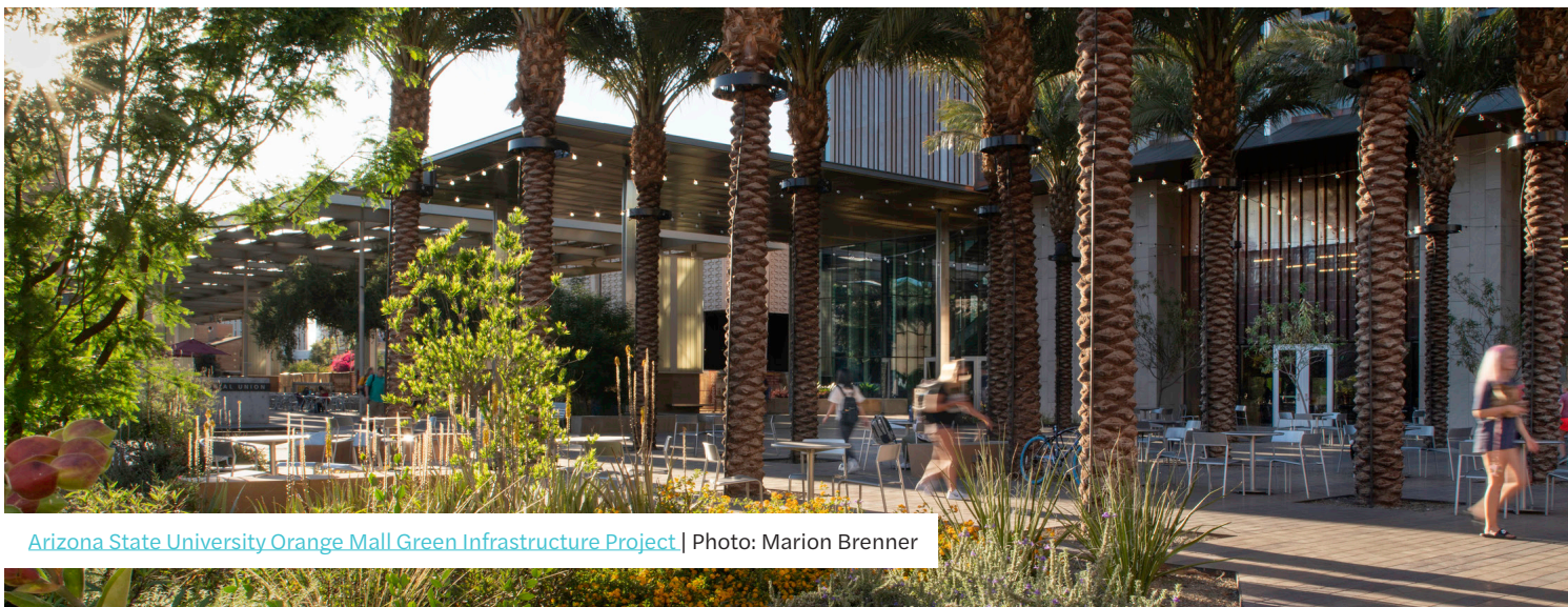
Arizona State University Orange Mall Green Infrastructure Project

Do you know of additional local, state or federal regulations incorporating SITES? Are you pursuing this kind of work in your own institution? Let us know by emailing sites@gbc.org .