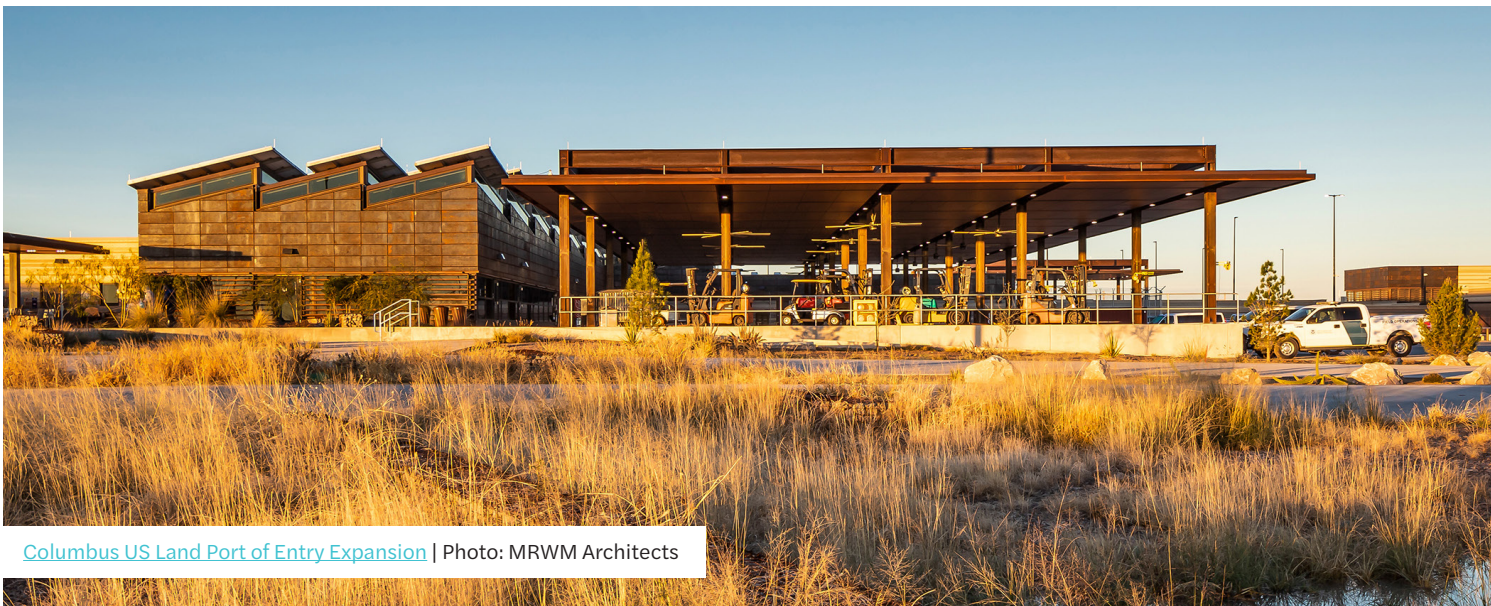
Columbus US Land Port of Entry Expansion | Photo: MRWM Architects