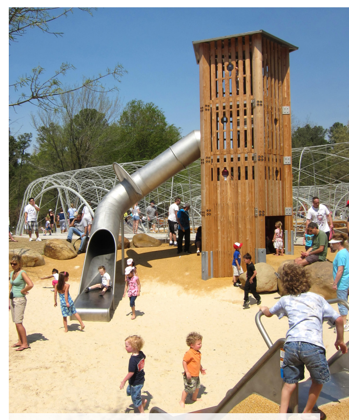
SITES Certified Woodland Discovery Playground | Memphis, TN

By supporting the SITES certification system, SITES APs help ensure landscapes and places implement nature-based solutions to climate change, conserve resources, create regenerative systems, foster resiliency, and enhance human well-being. SITES APs are critical to educating clients, colleagues and the community about the essential role that SITES plays in protecting and restoring the environment and the community.